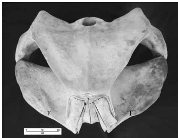
Figure 3 - Dorsal view of the skull of the studied whale (REMANE#02C0150/265), showing the straight contour of the anterior border of frontals (F), feature of dwarf minke whales skull (scale = 20 cm).