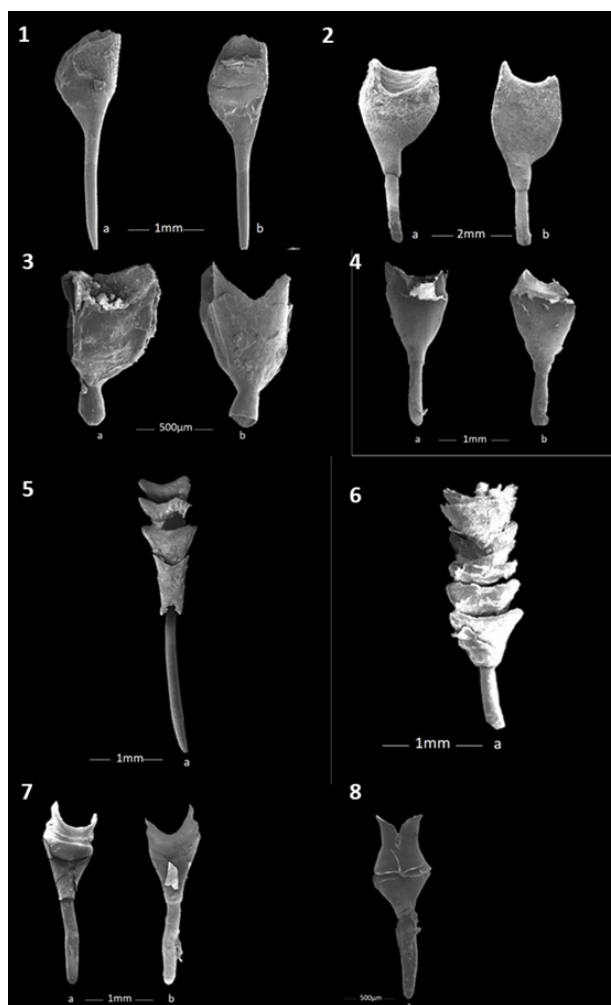
Figure 1. Pallets of the Teredinidae species from the mangrove forests of the Acaraú River estuary. a- outer face of the pallet, b- inner face of the pallet. Caption: 1- Nausitora fusticula ; 2- Neoterredo reynei ; 3- Teredo turnerae ; 4- Teredo cf. bartschi ; 5- Bankia bipennata ; 6- Bankia gouldi ; 7- Lyrodus massa ; 8- Lyrodus cf. bipartitus .