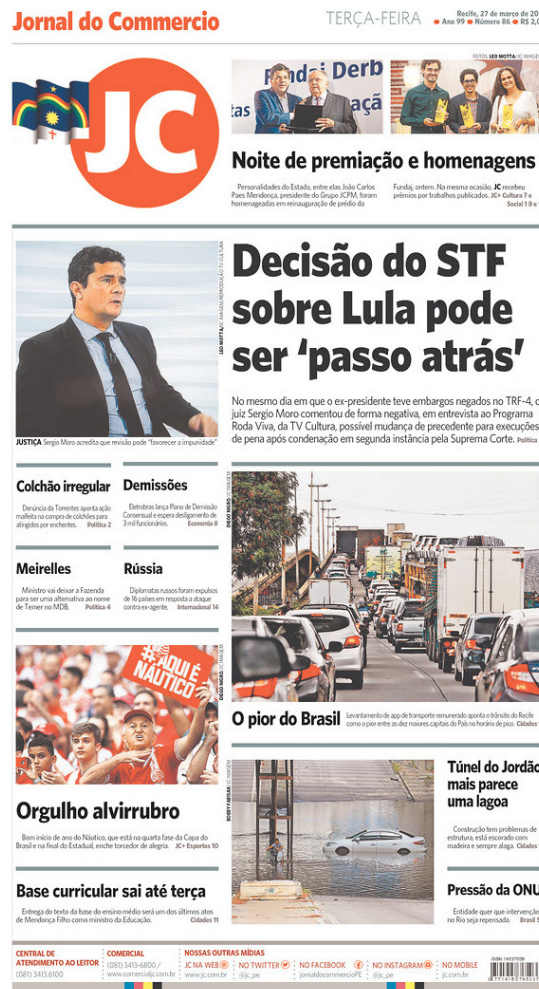
Figure 3 – Step backwards