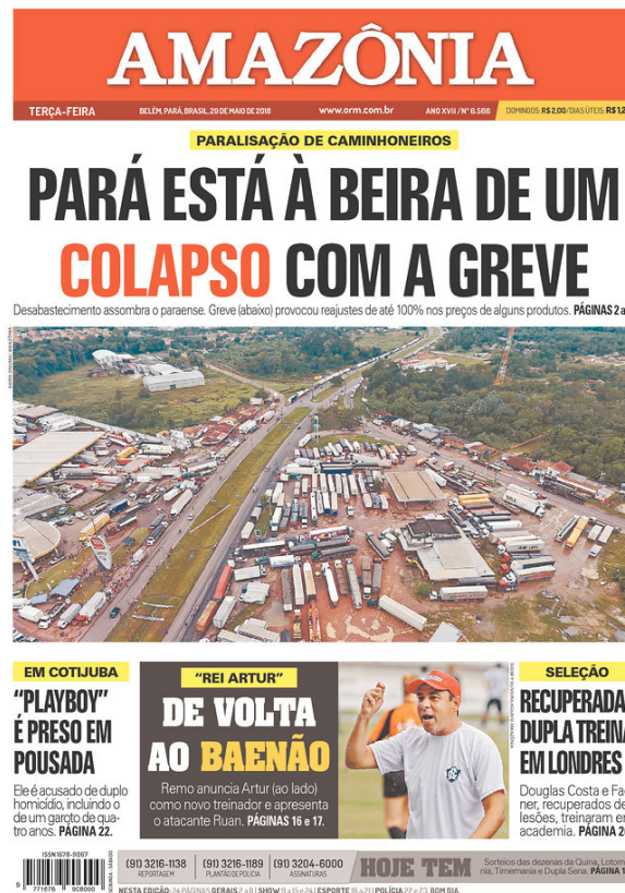
Figure 2 – Pará on the verge of collapsing