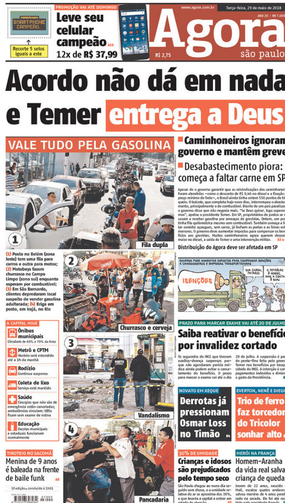
Figure 1 – Deal comes to nothing

The headline in Figure 1 Acordo não dá em nada e Temer entrega a Deus (roughly translated as Deal comes to nothing and Temer surrenders to God ) concerned a work stoppage by the country’s truckers, held in in May 2018.