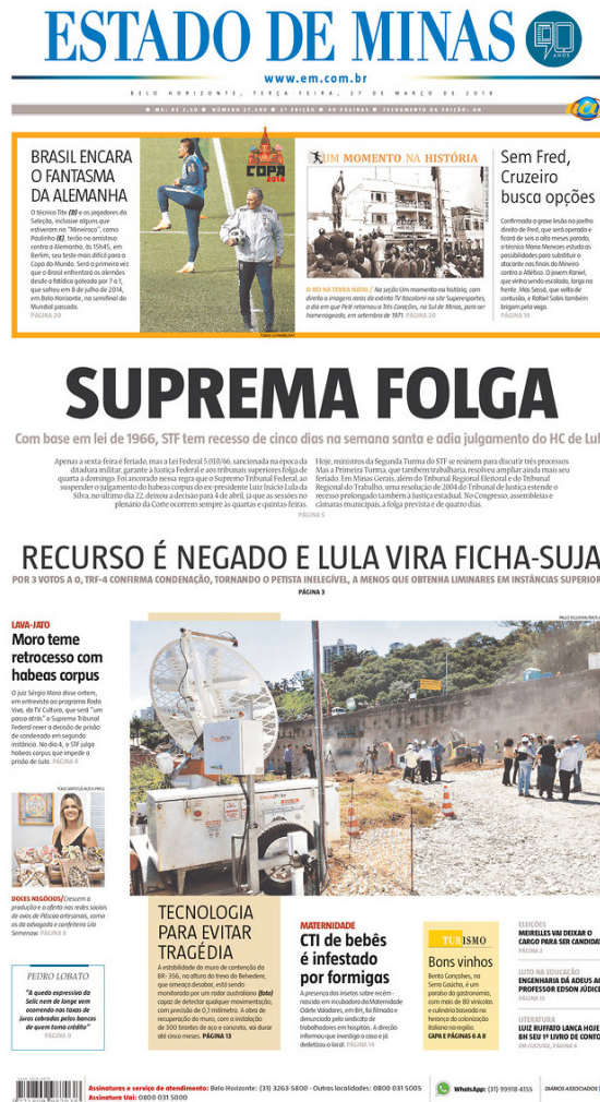
Figure 4 – Supreme break