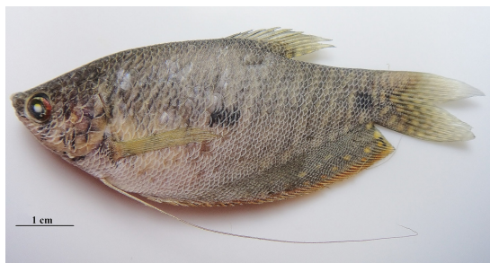
Figure 2. Specimen (61.6 mm SL) of T. trichopterus captured in the Santo Anastácio (SA) reservoir (Maranguapinho river basin).

specimens were cryoanesthetized, preserved in 70% alcohol and shelved in the fish collection of Laboratory of Systematic and Evolutionary Ichthyology of the Federal University of Rio Grande do Norte (LISE/UFRN) under entry voucher number UFRN3828.