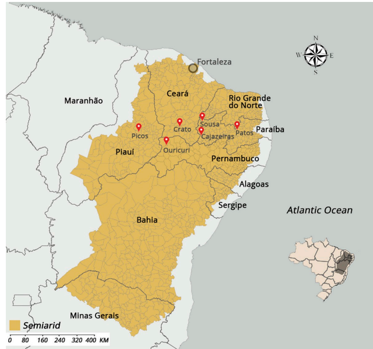
Fig 1. Location, participant enrollment and selection. The semiarid region includes the states of Ceará, Piauí, Rio Grande do Norte, Paraíba, Pernambuco, Alagoas, Sergipe, and Bahia of the Northeastern macro-region, but does not include Maranhão and the area north of Minas Gerais (Fig 1). The semiarid region covers 969,589.4 km 2 and has a population of 23.5 million. The estimated population of children under five years old is 2.3 million. The average annual rainfall is less than 800 mm and the aridity index can reach 0.5, which represents the water balance between precipitation and potential evapotranspiration. Drought risk in the semiarid region is greater than 60% [15].

https://doi.org/10.1371/journal.pntd.0007154.g001