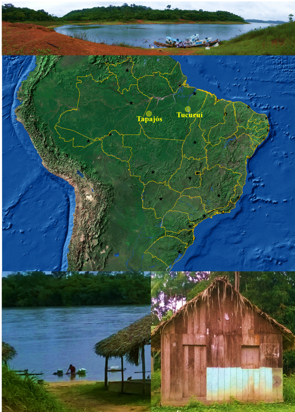
FIGURE 1 | Map of Brazil (obtained from the Instituto Brasileiro de Geografia e Estatística, Brazil) showing the States and their capitals ( black stars ). Yellow circles indicate the locations ( -4.287121, -55.984106 , and -3.800897, -49.811848 ) of riverine populations participating of this study. Photographs illustrates some conditions of the riverine populations: difficult access ( above ), river as a key element ( below left ) and precarious facilities ( below right ).