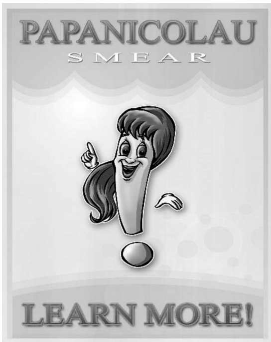
Figure 1: Booklet's cover: Papanicolaou smear. Learn more!.