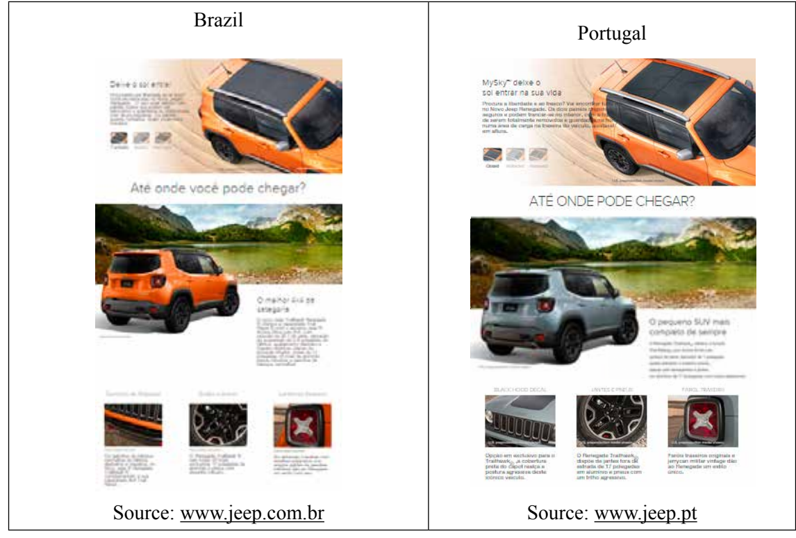
Figure 3 - Jeep Renegade section of the sites in Brazil and in Portugal.

It is important to note that, while some elements (like the sunroof description) are common to all the sites studied, others are mutually exclusive (the "essential adventure equipment" described in figure 2 is not mentioned in the European site, and the texts dealing with wheels and lights are not displayed on the US site).