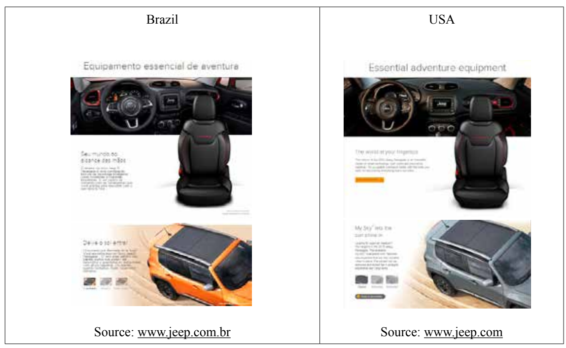
Figure 2 - Jeep Renegade section of the sites in Brazil and in the USA.