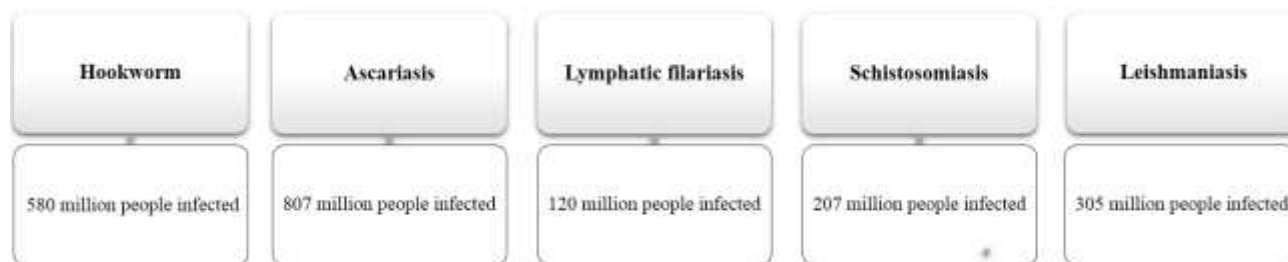
Figure 1 - Neglected diseases and the number of people infected.

Neglected diseases (NDs) affect more than 1 billion people worldwide and are responsible by deaths of more than one million people annually (MACKEY; LIANG, 2012; ROSALES-MENDOZA et al., 2012). The NDs have several characteristics in common, being main the poverty, lack of sanitation and health services. Among the NDs (Figure 1) more prevalent, can quote the lymphatic filariasis, hookworm, malaria, onchocerciasis, trachoma, leishmaniasis, chagas disease and schistosomiasis, in which are needed new drugs of low-cost, safe and effective (YAJIMA et al., 2012).