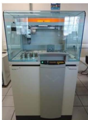
Figure 2. Apparatus Philips Axios 4KW (Imerys Steelcasting do Brasil laboratory)