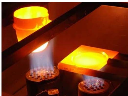
Figure 1. Melting device Vulcan VAA 2

Initially sample ( 0.75 \pm 0.0009 g) and flux ( 6 \pm 0.0009 g of \text{Li}_2\text{B}_4\text{O}_7 ) were heated in a furnace in a platinum crucible at 750 \text{ }^\circ\text{C} \pm 15^\circ\text{C} for removing carbon. Then, sample and flux were melted using a melting device VULCAN VAA 2 (Figure 1), producing a vitreous disc, which was analyzed using an apparatus PHILIPS AXIOS 4KW (Figure 2). In this way the elemental composition of the materials was determined by X-ray fluorescence technique.