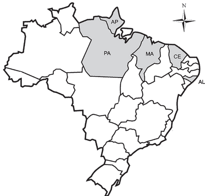
Figure 1 - Brazil’s map showing the states where samples were collected: Amapá (AP), Pará (PA), Maranhão (MA), Ceará (CE) and Alagoas (AL).

This study identified 3,827 shells from Alagoas, Amapá, Ceará, Maranhão and Pará states (Brazil) belonging to five species.