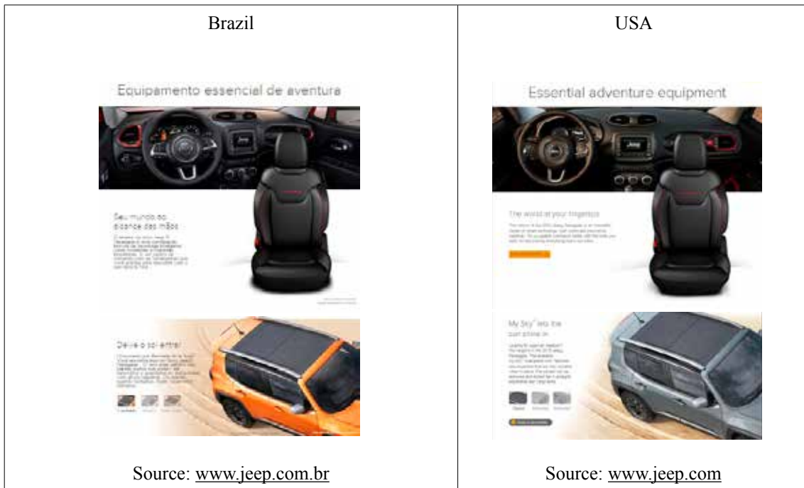
Figure 2 - Jeep Renegade section of the sites in Brazil and in the USA.