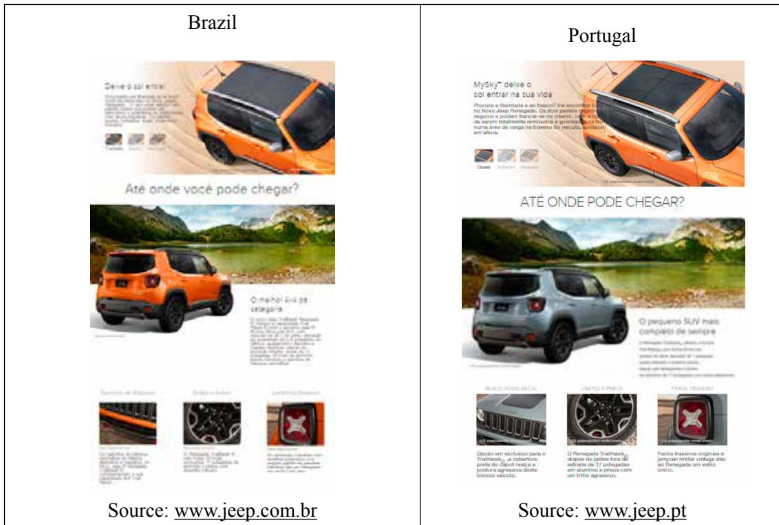
Figure 3 - Jeep Renegade section of the sites in Brazil and in Portugal.

It is important to note that, while some elements (like the sunroof description) are common to all the sites studied, others are mutually exclusive (the “essential adventure equipment” described in figure 2 is not mentioned in the European site, and the texts dealing with wheels and lights are not displayed on the US site).